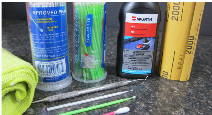
These tools and patience are all that are required

Porsche dealers sell touch-up tubes but you can also buy from online sources that have a wide range of colors for all years and models. The one that I have had the most consistent best quality is AutomotiveTouchup at www.automotivetouchup.com . Don't use the brush that is attached to the top with any paint.