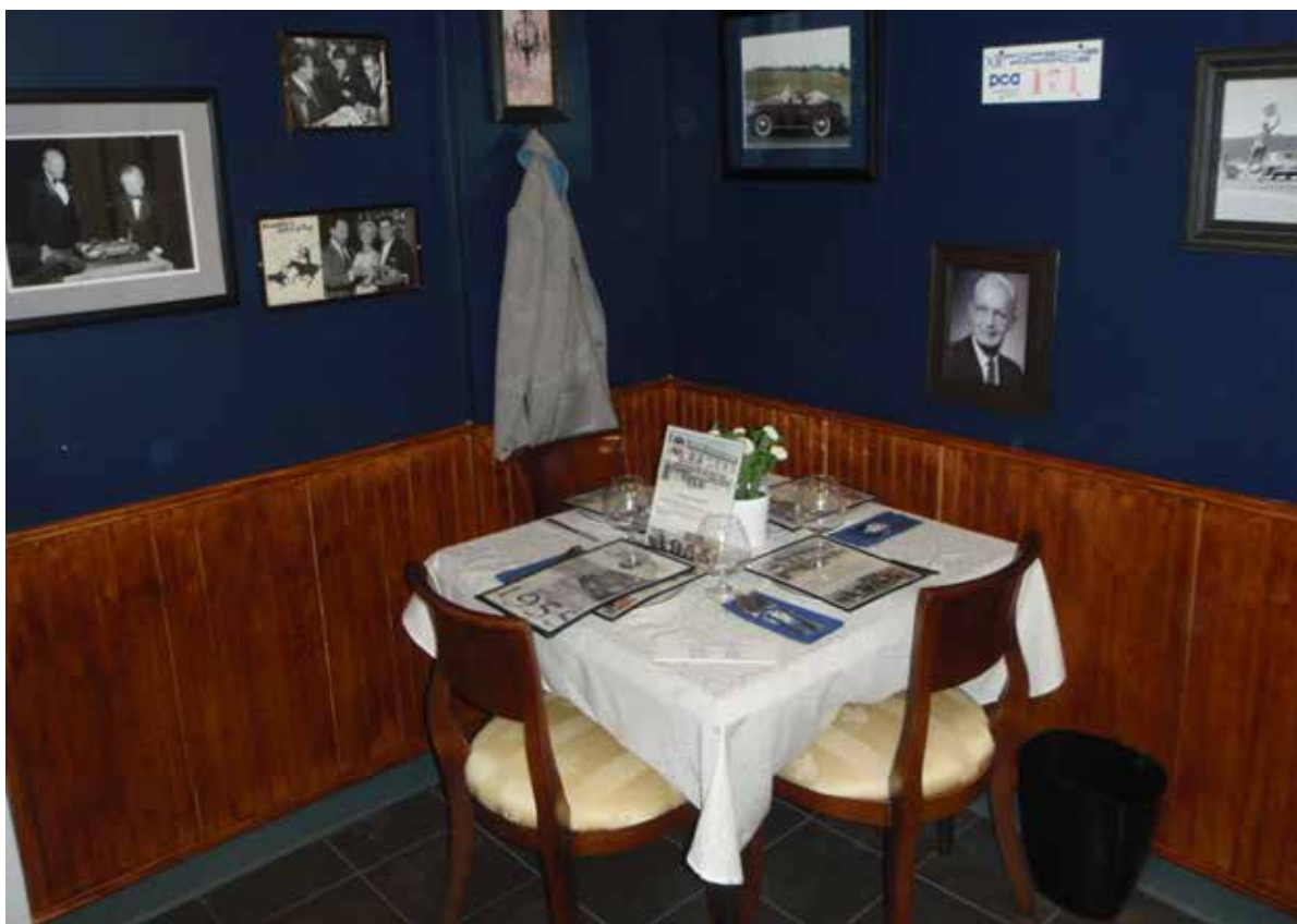
PCA Headquarters Reproduction of First PCA Meeting

the time of arrival. If your group is smaller and each member wishes to order individually, all you need to do is make table reservations. One suggestion – if you are paying and ordering separately, have the restaurant give you several smaller tables instead of one large table. For example, if there are twelve of you, two tables of six each, located close to each other, is more desirable than one large table for twelve. Why? Because of the food service! Most kitchens cannot cook twelve meals all at once and have them come out at the same time. So some meals are cooked first, then others, and finally the last one to two. The early meals are put in a food warmer, which tends to dry out the food and overcook it. The net result is that most of the dinners served are not as good, and there are a few disappointed folks.